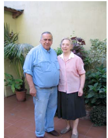
Above: The host families always give their guests a warm welcome and enjoy the opportunity to share Uruguayan life and culture with someone from a different country.